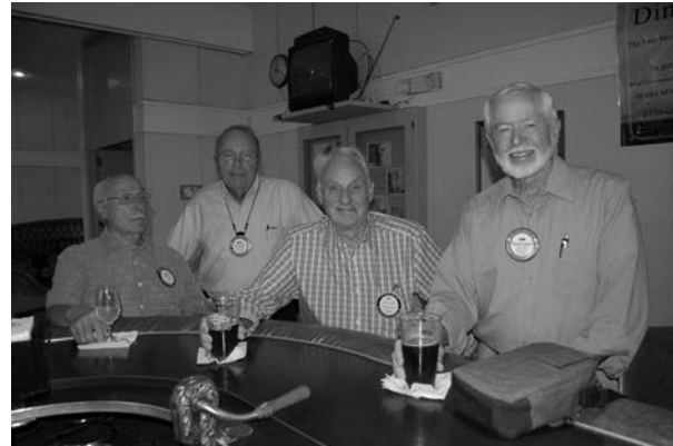
Four guys walk into a bar, a proctologist, a fireman, a tea maker and a telephone guy .

Ever wonder why The Grey Eagles are always so jovial? A hidden camera captured these “pre-meeting, pre-loading” shots of the Eagles roosting.