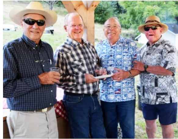
There was no shortage of trouble-makers.