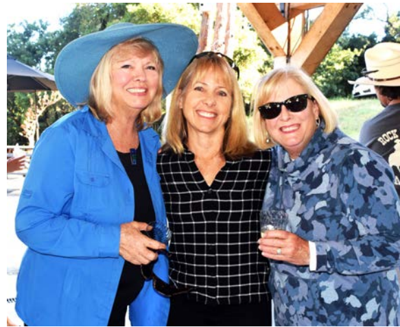
Like I said...no shortage of troublemakers.