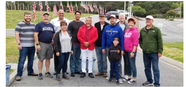
Flag Day at Oakwood Memorial