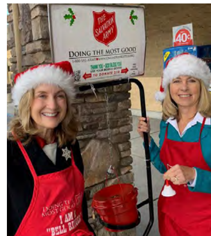
Rotary Bell Ringers Collected $1,693.01 for the Salvation Army!