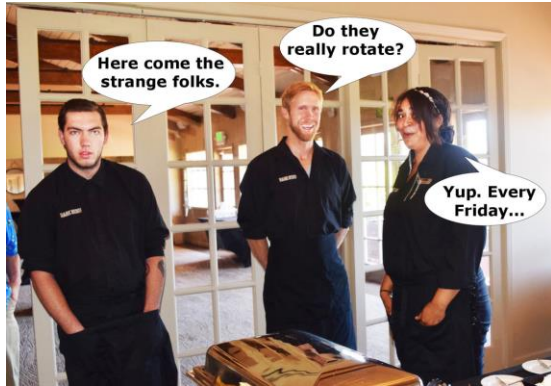
Uh-Oh! We've been found out!

INVOCATION: Gary delivered a classic Reeceism that advised us to think of something that would give us a permanent