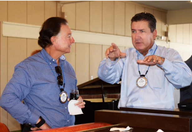
And this is how I play the “Air Piano”

the founding and organization of the San Lorenzo River Alliance. He used photos, both historic and current to illustrate the various changes having taken place along the river. The main message in the talk was about transformation of the river, levee and walkways to encourage positive loitering. In other words making the San Lorenzo River a place the whole community can enjoy.