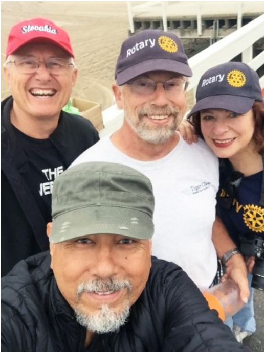
Rotary Beach Clean-up Yay!