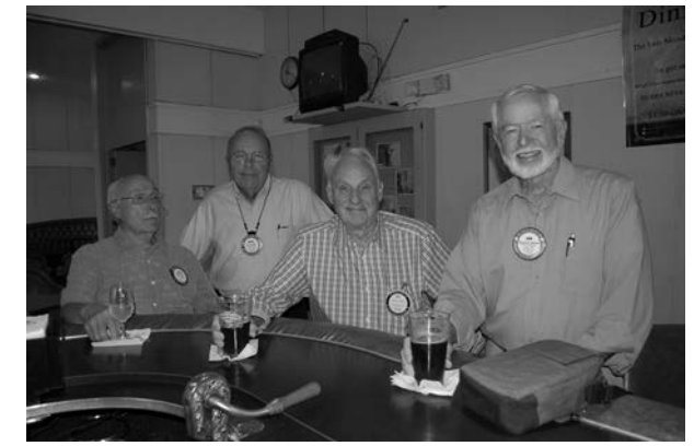
Four guys walk into a bar, a proctologist, a fireman, a tea maker and a telephone guy .

Ever wonder why The Grey Eagles are always so jovial? A hidden camera captured these "pre-meeting, preloading" shots of the Eagles roosting.