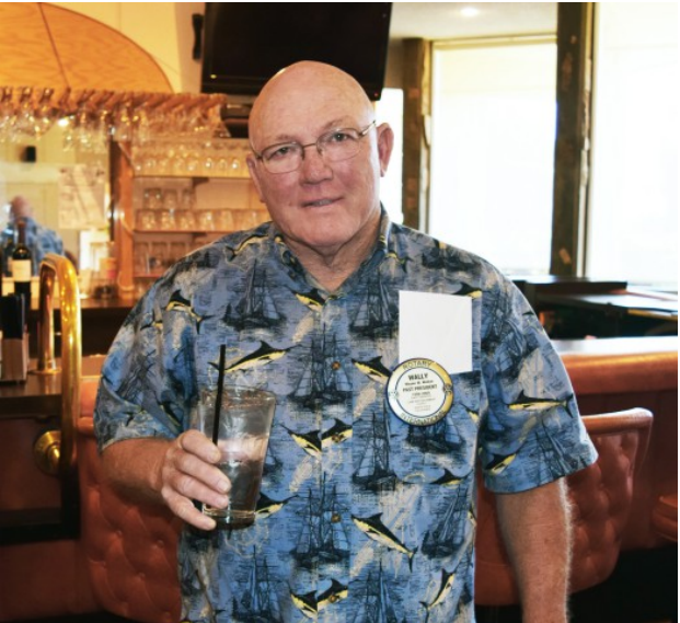
I can’t wait for the program, oh boy!

areas of vocational study. Each of the students said a few words and thanked the club. I picked up on 5 recurring words, “dreams” “reality” “gift” “college” and of course “thanks”. There are few programs that can match young people being assisted by Rotary and expressing their thanks for recognition for their hard work in school. For those of you who missed it, well you know...you missed it.