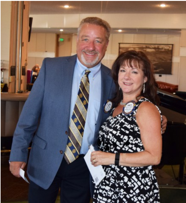
Let me show you my new iwatch, it’s right over here in the lounge.