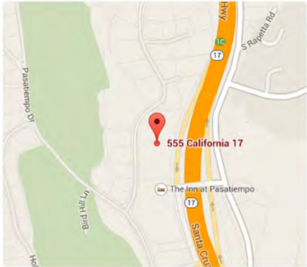
It’s the old Pasatiempo Inn