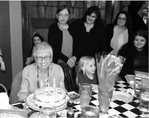
Mom with her cake