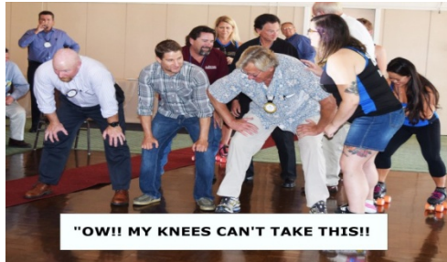
The resulting melee ensued . . .