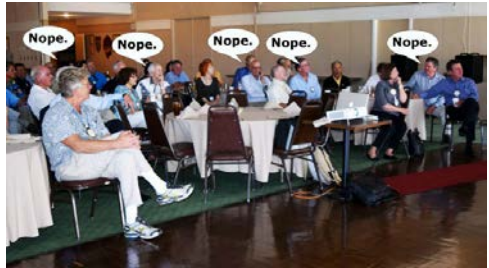
The stalwart stood fast . . .