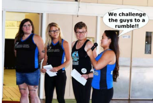
The response was overwhelming . . .