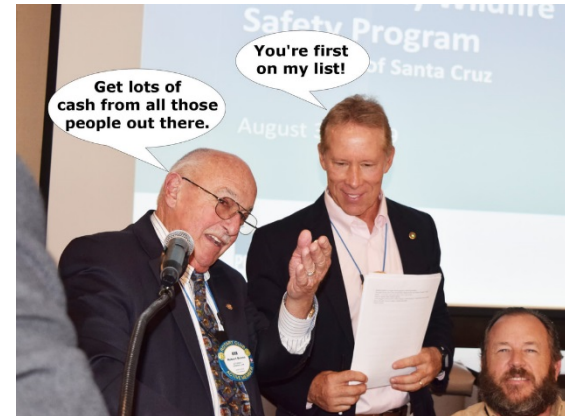
Like Father, Like Son: Passing the Rotary Torch!