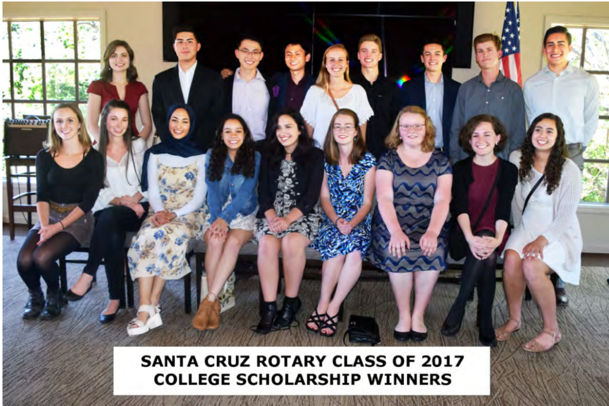
SANTA CRUZ ROTARY CLASS OF 2017 COLLEGE SCHOLARSHIP WINNERS